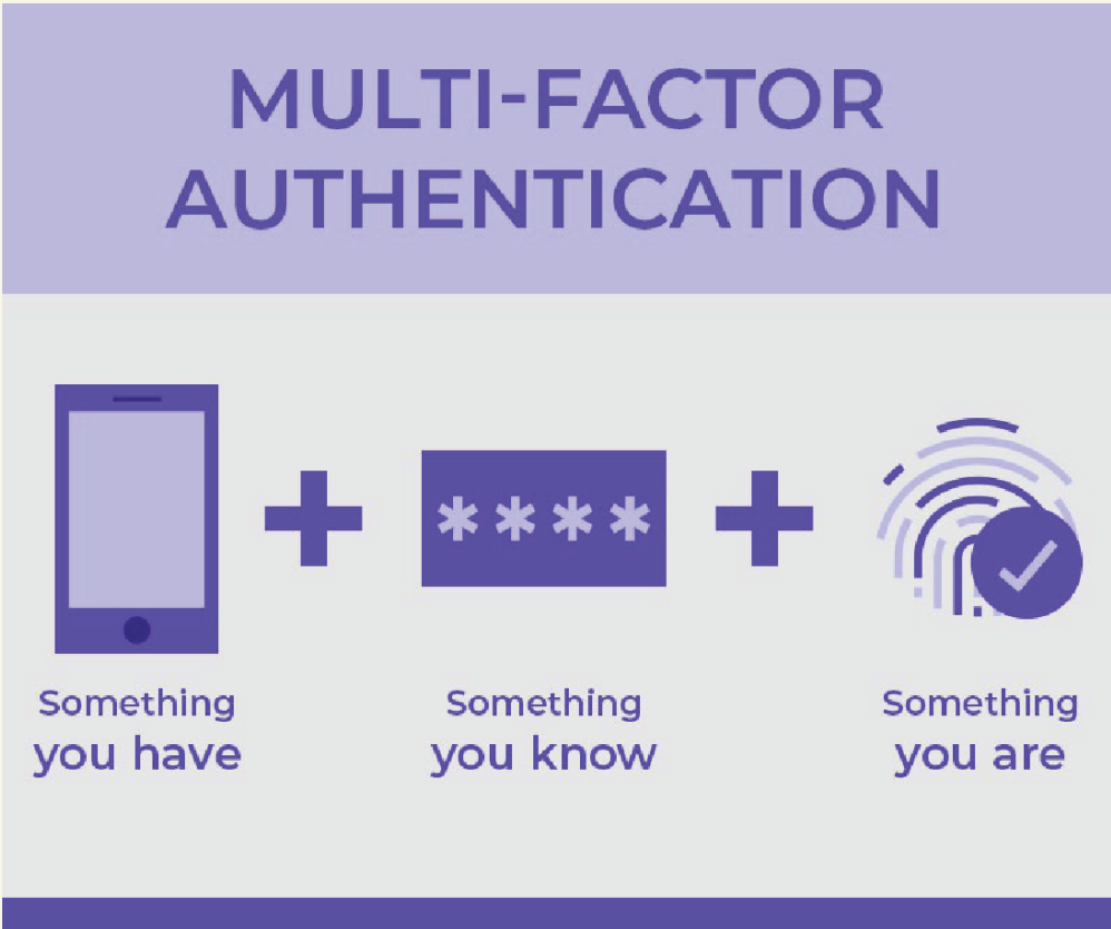
Figure 1: Multi-factor Authentication Factors. Source: CISA and NSA 4

Security agencies, national organizations, and businesses strongly suggest implementing multi-factor authentication to protect our digital identities and data better. MFA is an approach to strengthen the authentication process by requiring the user to present multiple elements in different categories, or “factors,” as part of an authentication attempt. These factors, shown in the image below, are something you have, something you know, and something you are.